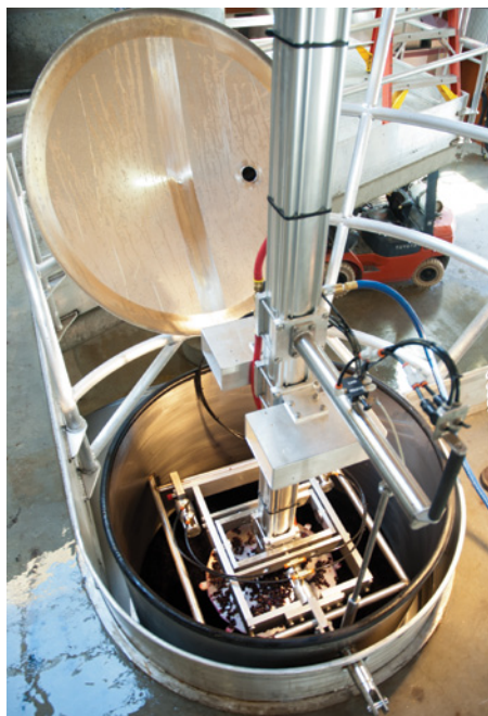
A portable pneumatic punchdown device attaches to bars on the upper manway turret, keeping the gimbal from rising while the foot of the device presses down on the cap.