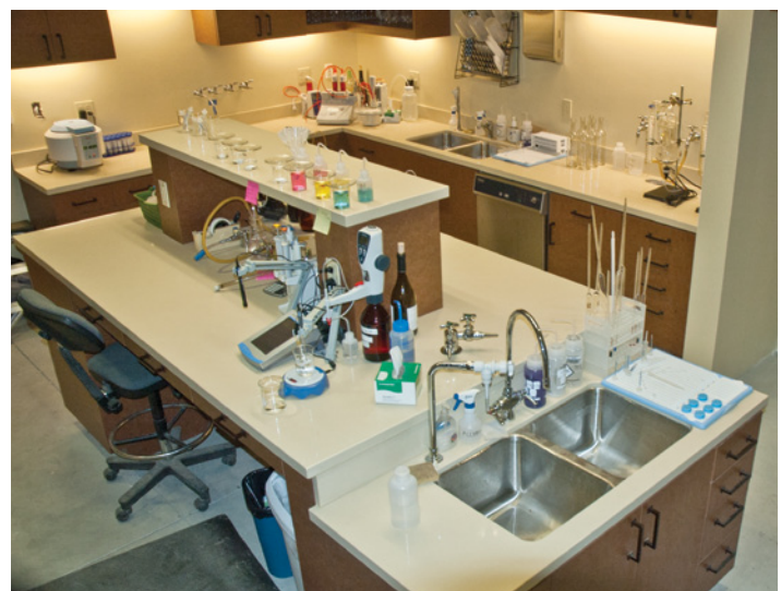
The laboratory is 420 square feet with cream-colored Caesar Stone countertops.

The CO 2 removal and night air cooling systems were designed as a dual function system. Natural cooling of the building is achieved with louvers in the cupolas (located in the ceiling) coordinating