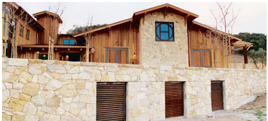
CO 2 sinks/enters the below-ground cavity under tanks (left), and an exhaust fan outside the building vents the CO 2 coming out through ducts (right) into the vineyard in front of the winery.