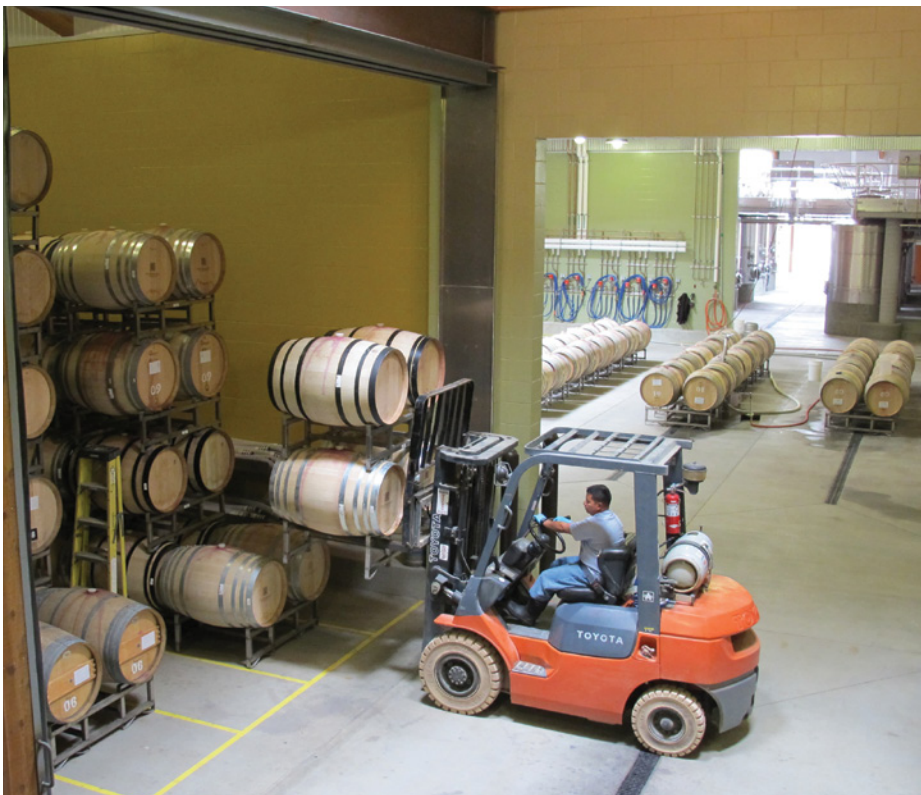
Easy removal of barrels from storage cell (left) to indoor barrel working area (left, background). Two reels drop nitrogen hoses from the ceiling (right) to provide nitrogen for a Racketeer debarreling wand, keeping the floor free of hose congestion for unencumbered activity.