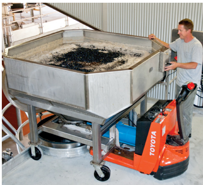
Sorted grapes are dropped from pod into top of tank fermentor.