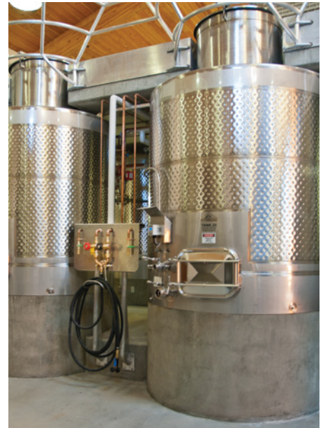
Tanks on concrete pedestals, with access to hot water, cold water, nitrogen, and compressed air. The tanks are "skirted" — welded to cover the gap between the bottom of the tank and concrete, so no water can get underneath the tank when cleaning or spraying down the outside.

A mobile Pulsair system can be moved among tanks on the mezzanine [see photo page 2]. The operator positions the Pulsair unit close to the tank manway and connects a 5/8-inch air hose feed to the Pulsair cart containing a 60-gallon air tank with Pulsair filters and delivery system.