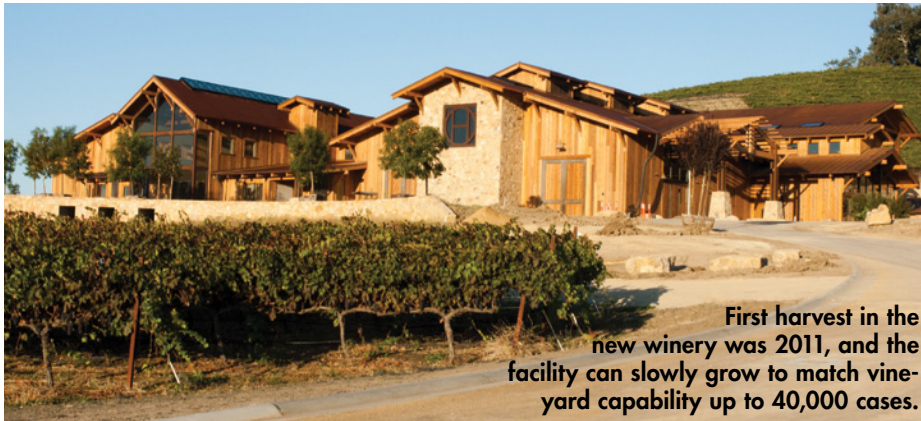
First harvest in the new winery was 2011, and the facility can slowly grow to match vineyard capability up to 40,000 cases.

urethane panels on the interior and 2x6 studs on the exterior. The stud framing goes from the finished floor to the roof and contains R-19 insulation. The interior of the 4-inch panels is clad with corrugated galvanized sheeting and the block is coated with filler and epoxy, giving the interior corrosion and impact resistance.