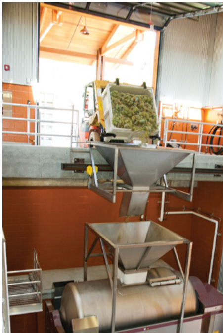
Dumping white whole clusters through the hopper into Diemme Velvet membrane press.

with the exhaust fans. The diurnal swing decreases temperatures (at night), down to the low 50s. As the outside temperature falls below inside temperature, the louvers open and the exhaust fans turn on, drawing outside air to cool the building.