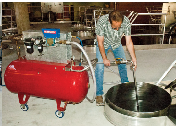
Mobile Pulsair Tank Mixer on mezzanine level. Winemaker positions the wand through the cap to the tank bottom, injects pulses of filtered compressed air under the cap, and moves the wand to different places under the cap until the must is well-mixed.

In addition, the building houses an indoor barrel working/portable fermentor room, the laboratory, and administration and storage rooms. The expandable portions would be barrel and case goods storage, which include caves and above-ground warehousing, and more space for larger fermentation tanks if needed.