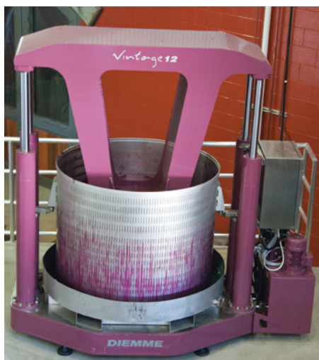
Halter Ranch has two Diemme "Vintage 12" basket presses for small red grape lots requiring careful pressing.

During the fermentation season, CO 2 monitoring equipment automatically activates fans in particular zones throughout the winery, to remove dangerous levels