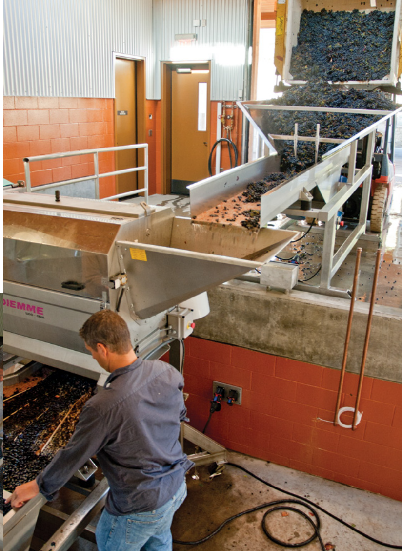
Receiving hopper and vibrating conveyor can deliver 8 to 10 tons/hour of grape clusters to the Kappa 25 destemmer (right). Grapes are sorted at 2 to 3 tons per hour, and fed to the pod for transport to fermentor (left).

H alter Ranch Vineyard's state-of-the-art winery was designed and built to take advantage of the newest technologies, with efficiency, cleanliness, and maximum flexibility as goals. The 34,000 square foot structure is nestled into one of the original Macgillivray Ranch plantings in the Adelaida Hills west of Paso Robles, CA.